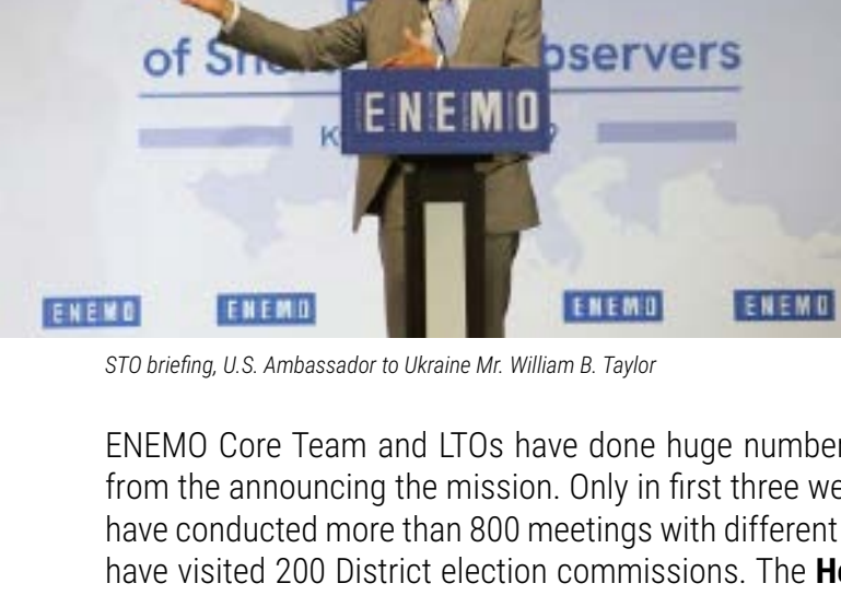
STO briefing, U.S. Ambassador to Ukraine Mr. William B. Taylor